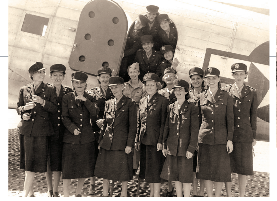
The angels of Bataan and Corregidor arrive at Hickam Field in Hawaii on February 20, 1945.

and Navy nurses had never trained for combat, and yet they were now in the middle of a war zone.