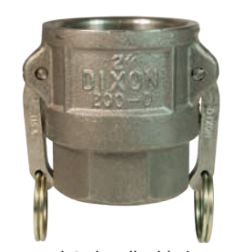
unplated malleable iron