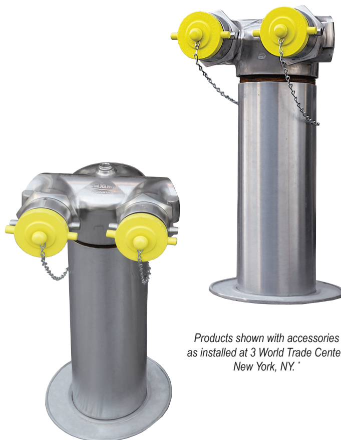
Products shown with accessories as installed at 3 World Trade Center, New York, NY.*