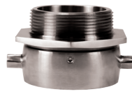
3" x 3" male (polished satin finish)