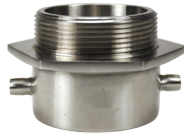
2½" x 3" male (polished satin finish)