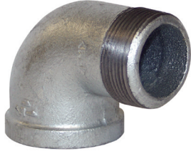
150# galvanized iron