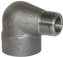
3000# forged steel