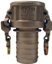
316 stainless steel