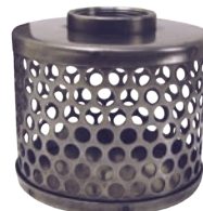
304 stainless steel