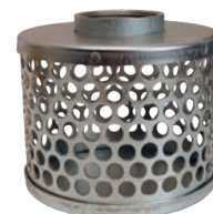
zinc plated steel