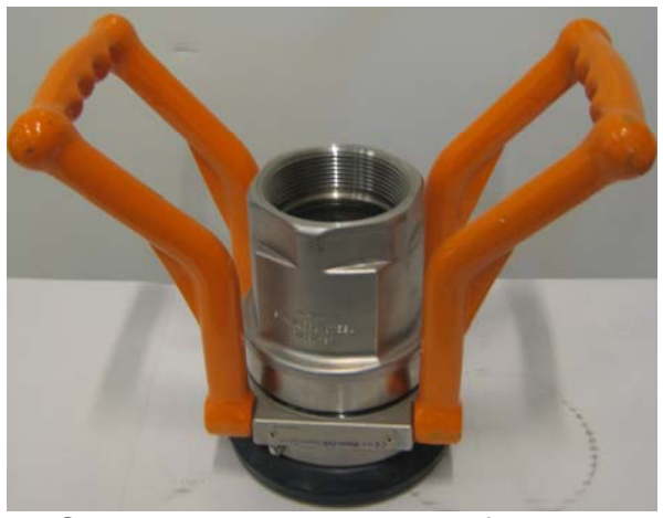
Loctite® is registered trademark of Henkel.

Apply sealing wax on the top of the lock screw after screwing it in, to prevent misuse.