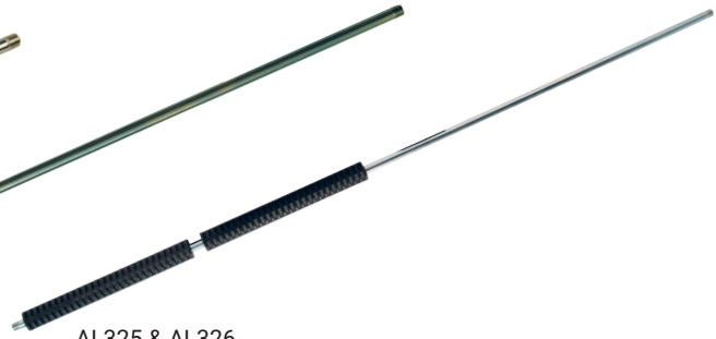
AL325 & AL326