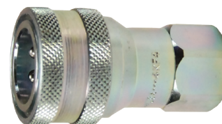
4KF4 - steel