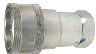
10KF10 - steel