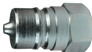
K6F6 - steel