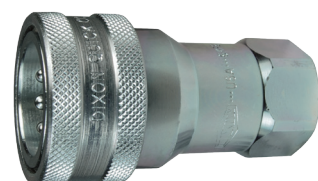
4KF6 - steel