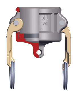
Type DC<sup>1</sup> dust cap