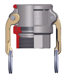
Type D coupler x female NPT