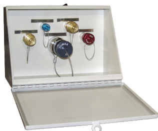
receivers sold separately