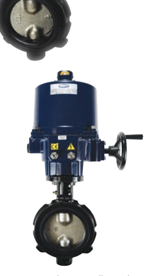
Actuated Butterfly Valve