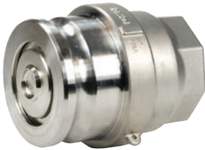
Adapter x 3" Female NPT