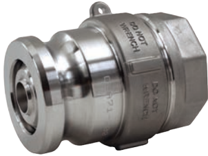
Adapter x 1-1/2" and 2" Female NPT